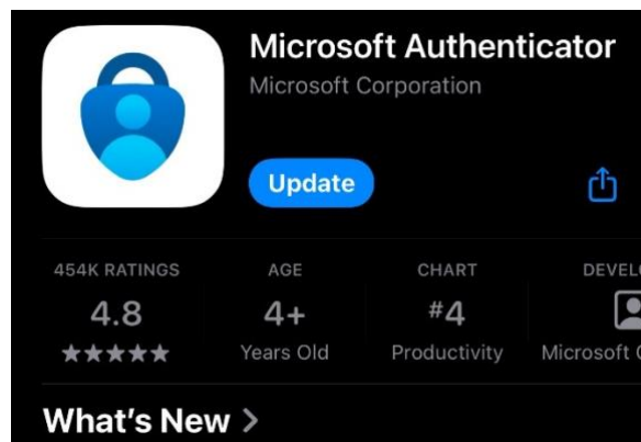
Figure 1 - The iOS App Store listing for Authenticator